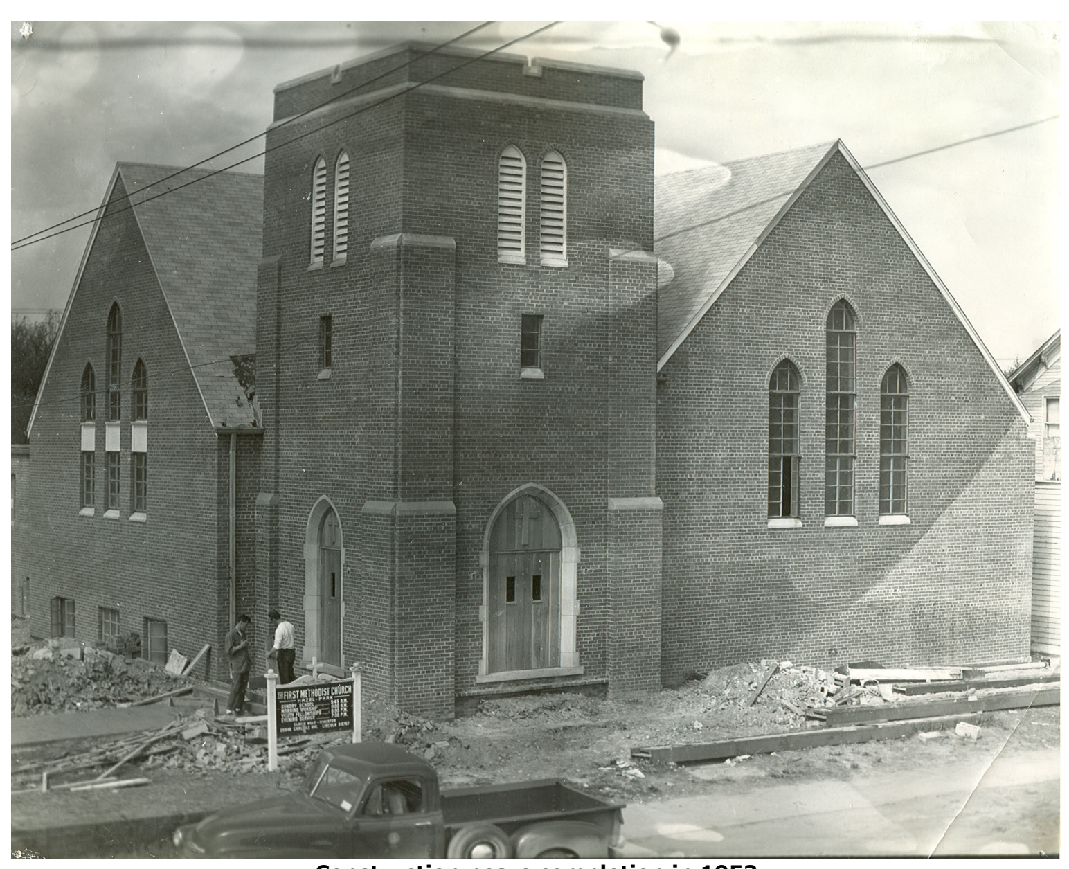
Construction nears completion in 1953