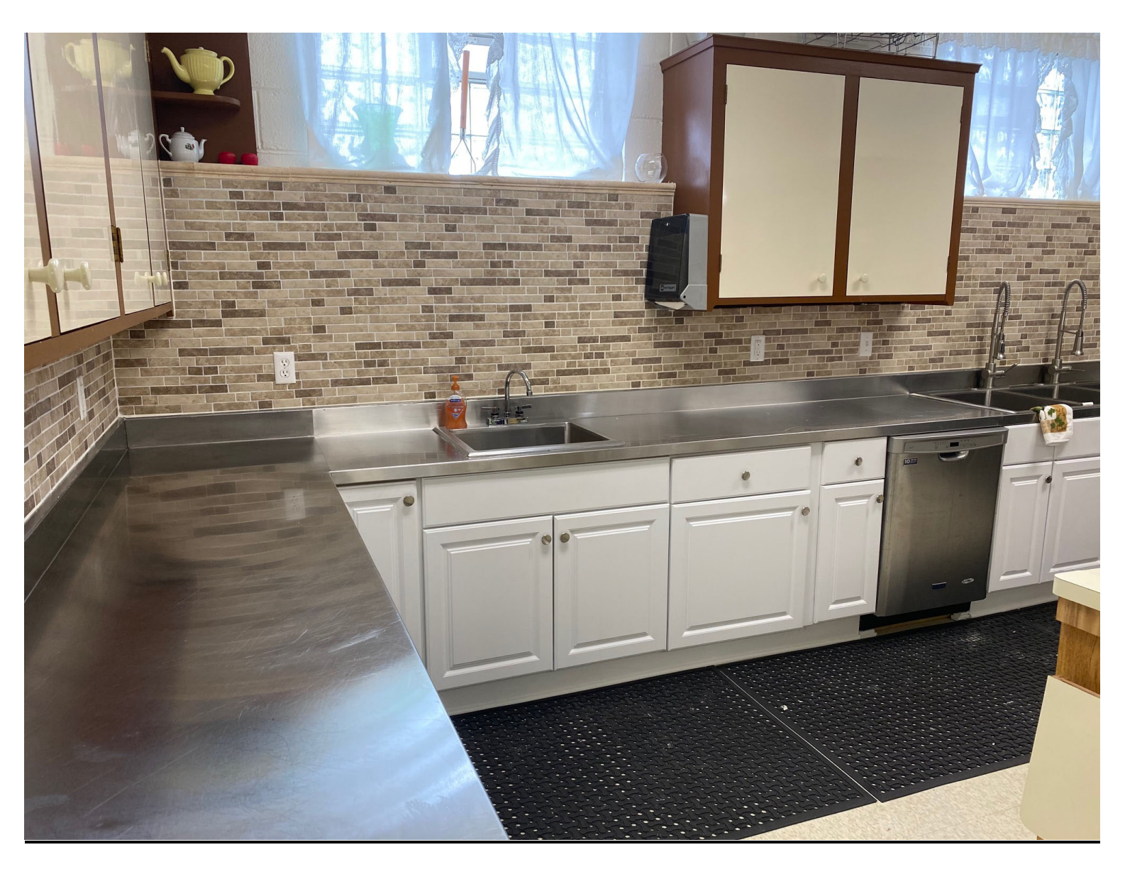
Our Updated Kitchen in 2020