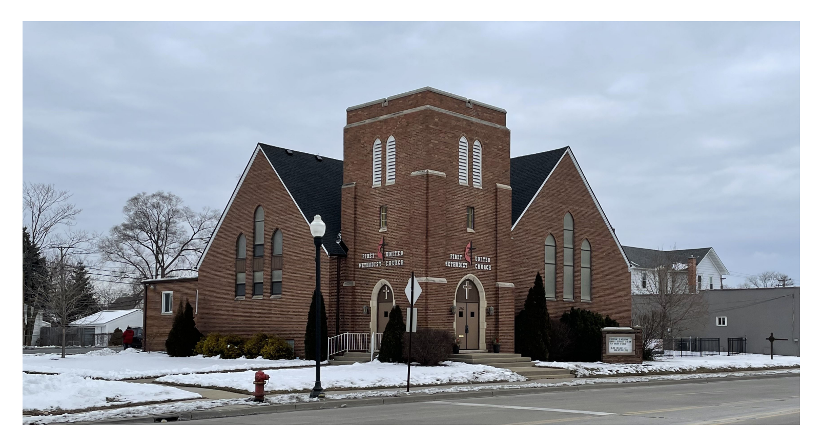
Exterior view of the church in February 2023, showing new roof and gutters.

In 2022, memorial contributions allowed for the replacement of the church roof and gutters.