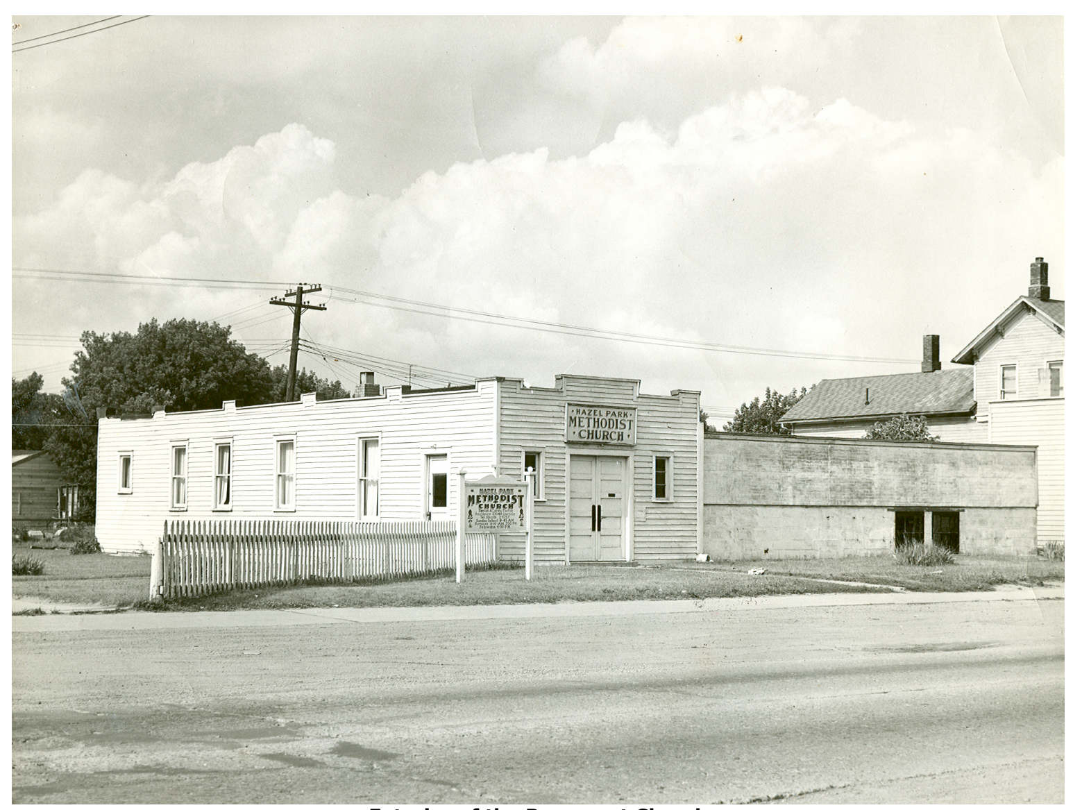
Exterior of the Basement Church

The First United Methodist Church of Hazel Park was established in November of 1924, as a Missionary project of the Royal Oak First Church. The first meeting was held in the Lacey School, and later moved to a feed store. One summer, the church used a tent for services. By 1926-27 a basement church, located on the property of the current church, was excavated, and would serve as the church meeting place for the next 25 years. The basement church started out with just 4 walls, but over time, improvements were made. Folding doors were installed to make a classroom (known for many years as Mrs. King's room); a furnace was installed; people donated dishes, towels, and kitchen utensils they could spare; and dinners were put on to raise money for hymn books, chairs, and other things that were needed.