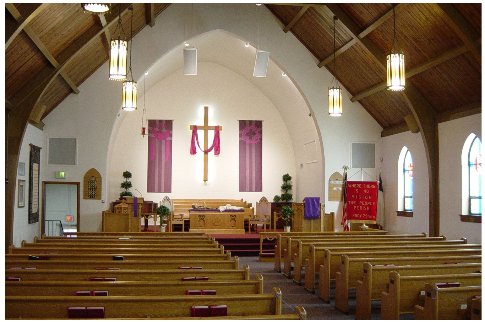
Our sanctuary in 2008

In 1991, chair lifts were installed to allow access to both the lower and upper levels of the building. The 1990's brought a new furnace and air conditioning, pew cushions, a new grand piano, and organ.