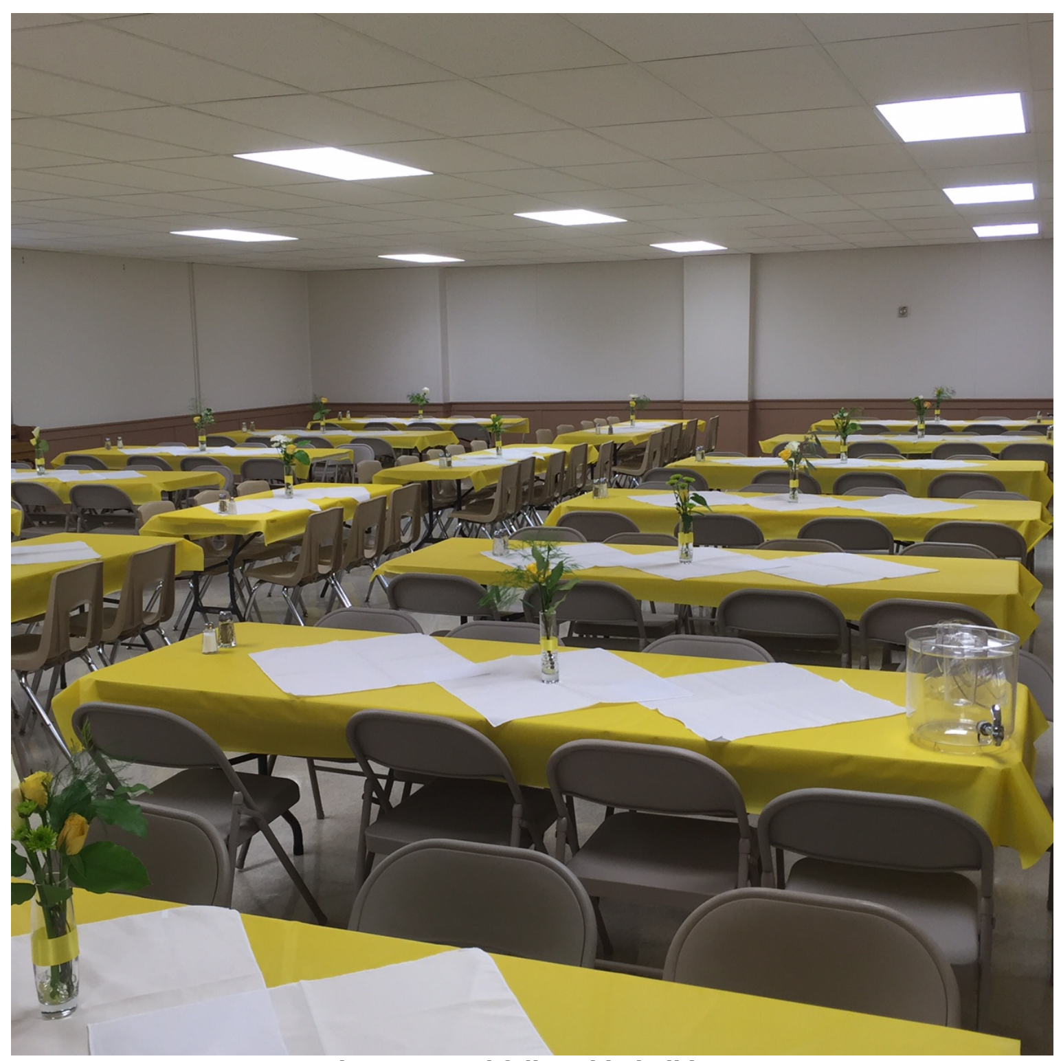
Newly renovated fellowship hall in 2016

Also in 2020, the COVID epidemic brought about several immediate changes, including on-line worship, on-line donations, and Zoom meetings, all of which were all quickly implemented and continue today. While in-person worship was temporarily halted, a new backsplash was installed in the church kitchen.